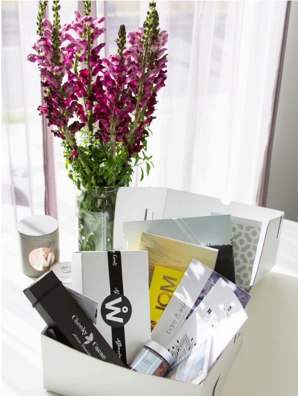
Urban Retreat Gift Box collaboration with Bare & Wild